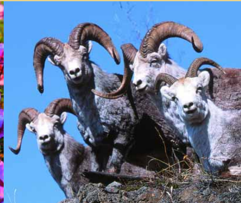
YG PHOTO BY S KRASEMAN