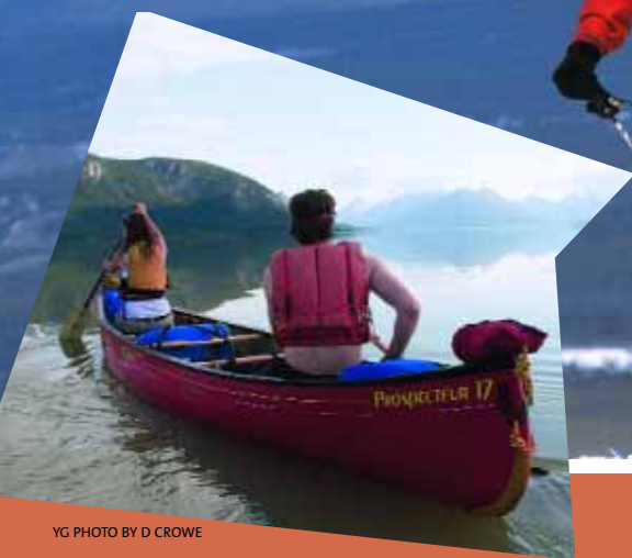
YG PHOTO BY D CROWE